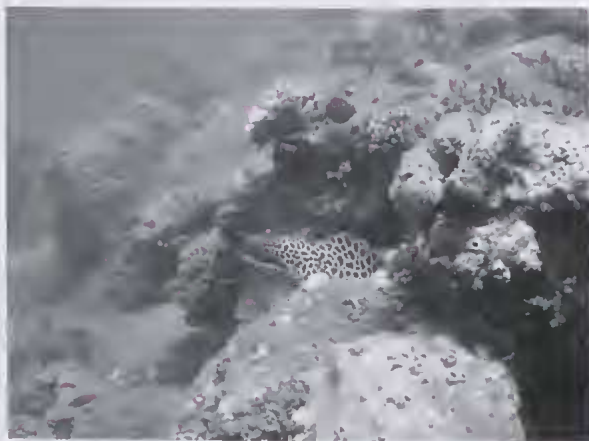
FIG. 3. Amity, Rockwall, North Stradbroke Island, Moreton Bay.

At Amity Rockwall, 27 species belonging to five families and 12 genera were recorded, and 19 species belonging to five families and nine genera were recorded at Tangalooma Wrecks (Table 1). Acropora millepora , A. sarmentosa , Montipora peltiformis , Favites russelli and Acanthastrea regularis from